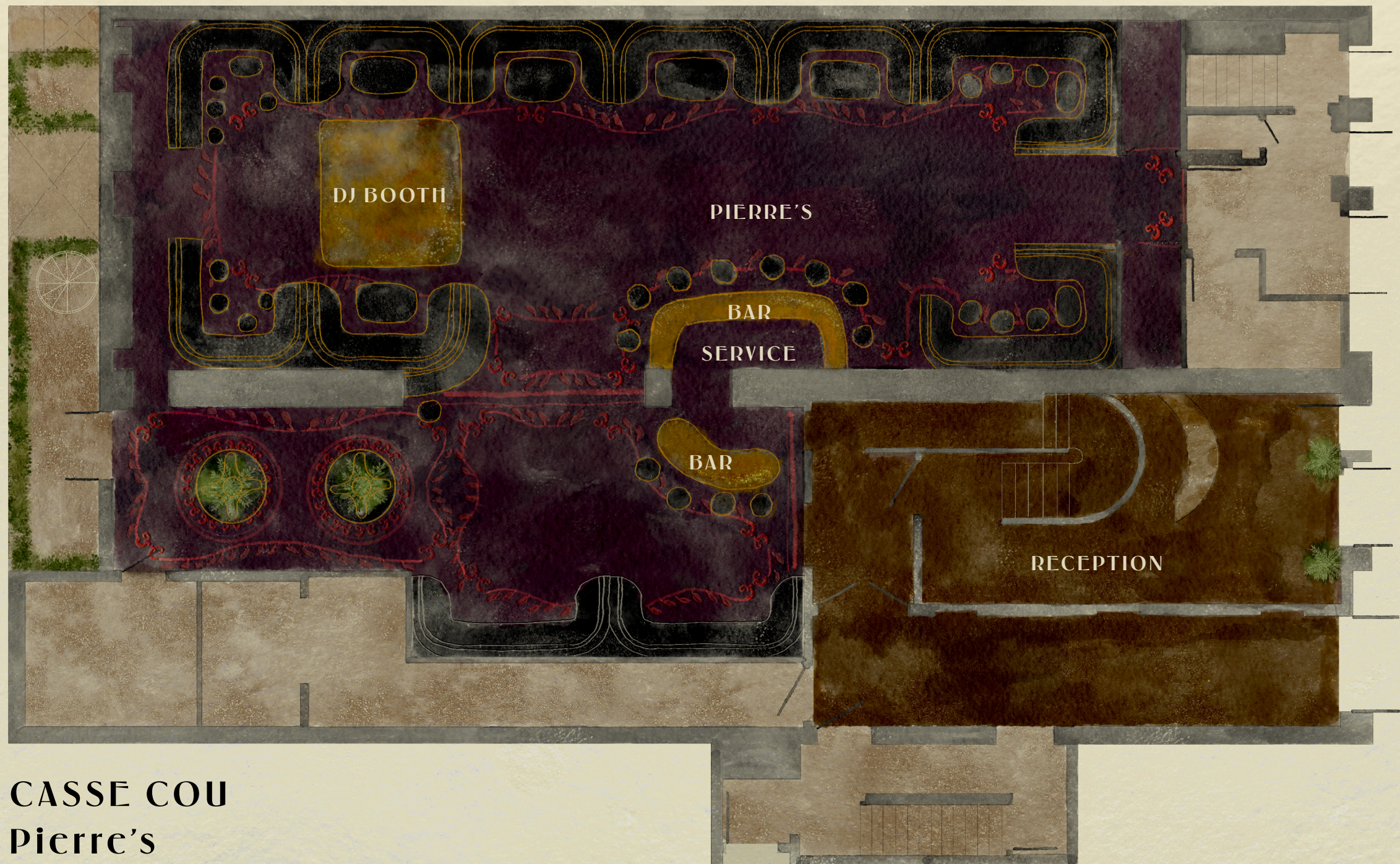
CASSE COU Pierre's