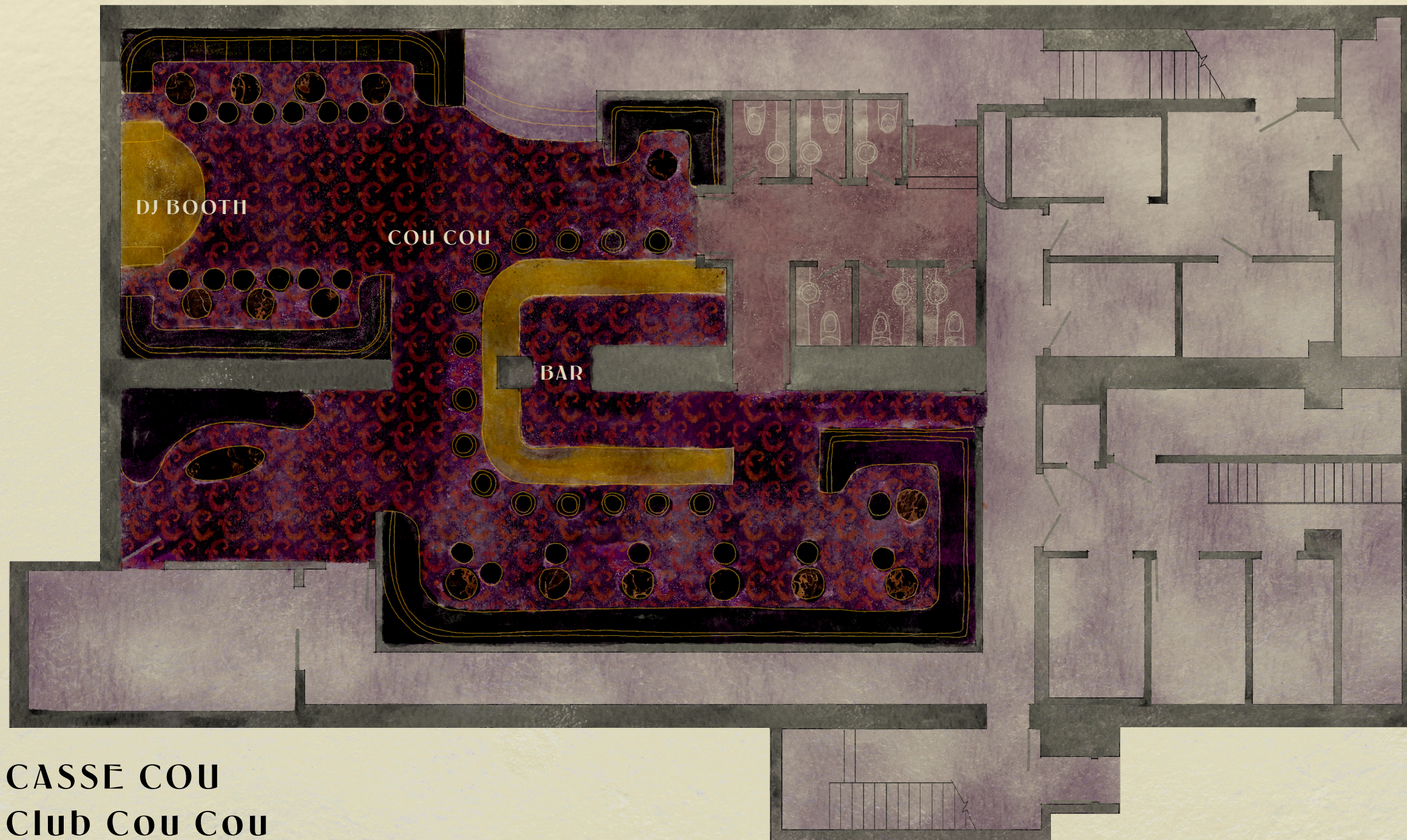
CASSE COU Club Cou Cou