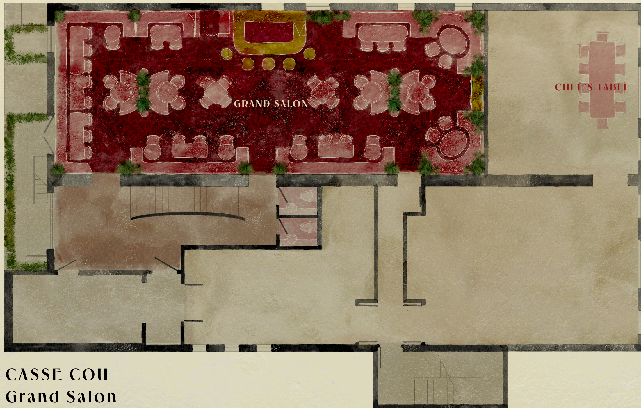
CASSE COU Grand Salon